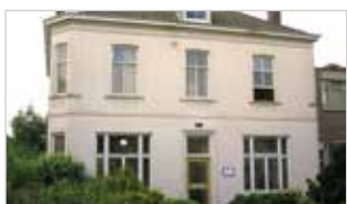
Hollindia Holding B.V. Driebergen The Netherlands