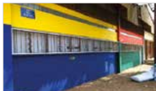
ColorPlus SARL Dakar Senegal