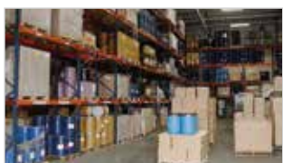
Hollindia warehouses Breda, Moerdijk & Nieuwegein The Netherlands