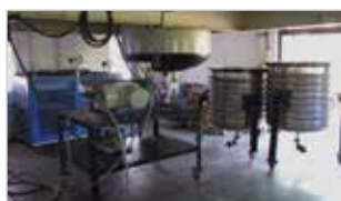
Taskar Chemicals PVT. LTD. Roha India