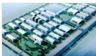
Holtint Chemicals (Jinhua) PVT. LTD. Shanghai China