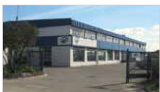
Hollindia Polska Sp. Z O.O. Lodz Poland