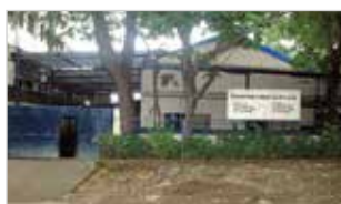
Eurosyntec Chemicals PVT. LTD. Rabale India