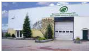
Hollindia International B.V. Nieuwegein The Netherlands